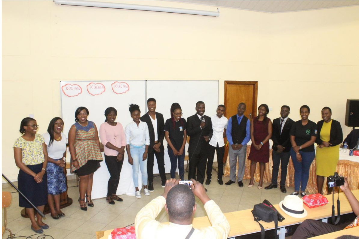
Group Photo with the Brand Ambassadors for the Department of Foreign Languages and Literature