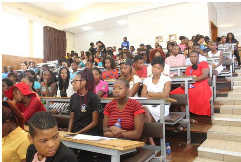
Foreign languages Students and Staff just before the Celebrations Began