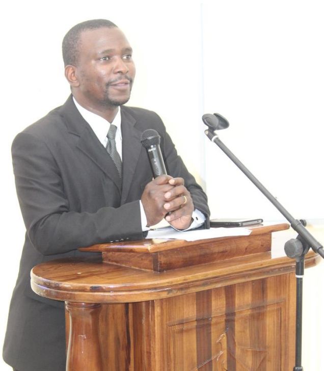
The Chairman, Department of Foreign Languages and Literature delivering the Opening Remarks.