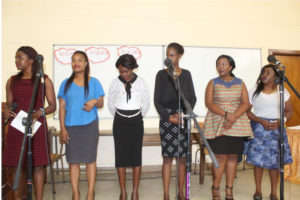
French Section Choir