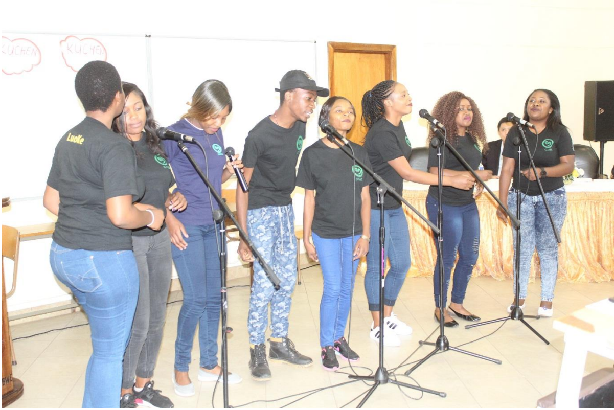
Confucius Institute Choir