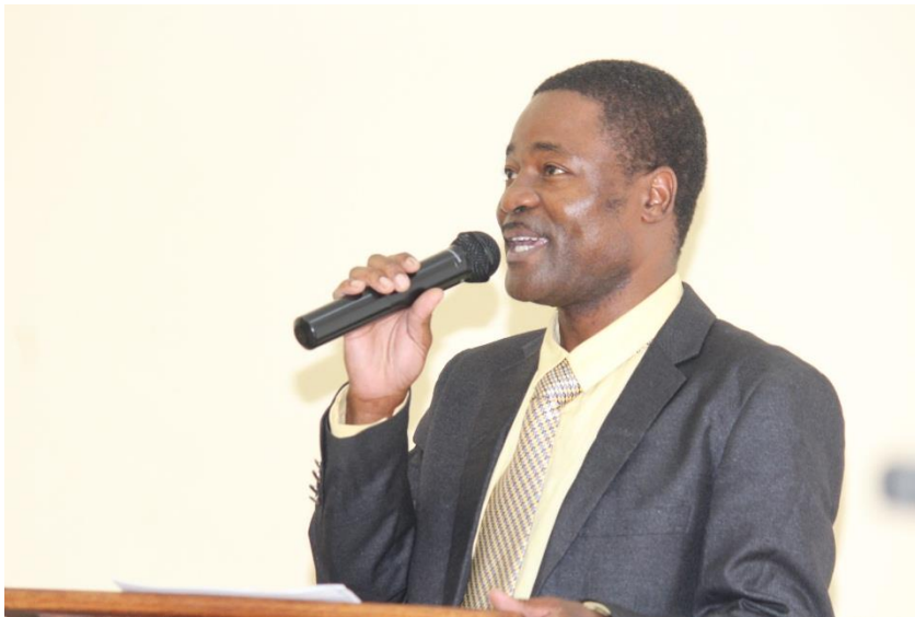
The Mozambican Embassy, Minister Councilor, Mr Adinito delivering his speech