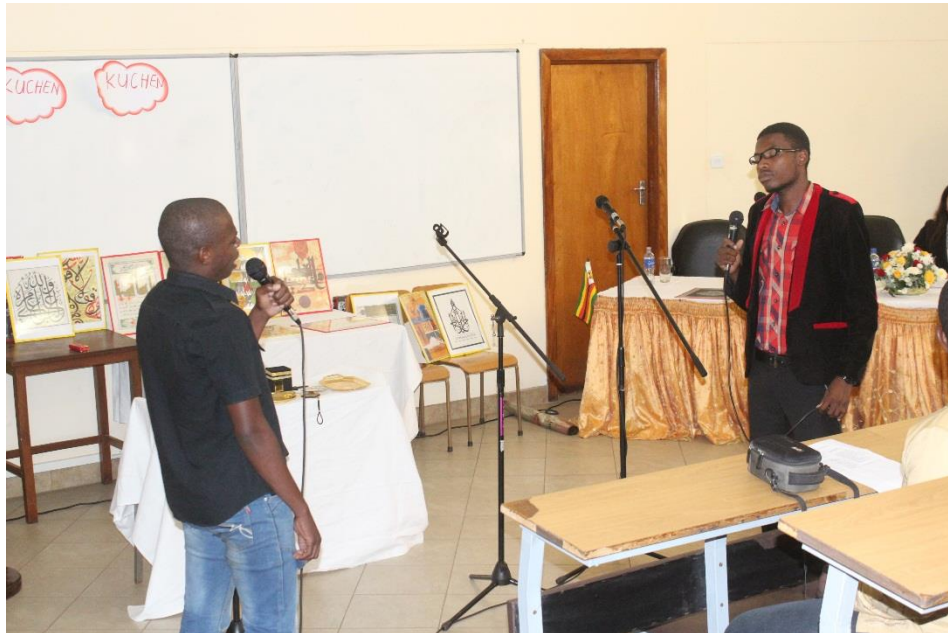
Arabic Students' Performance Skit