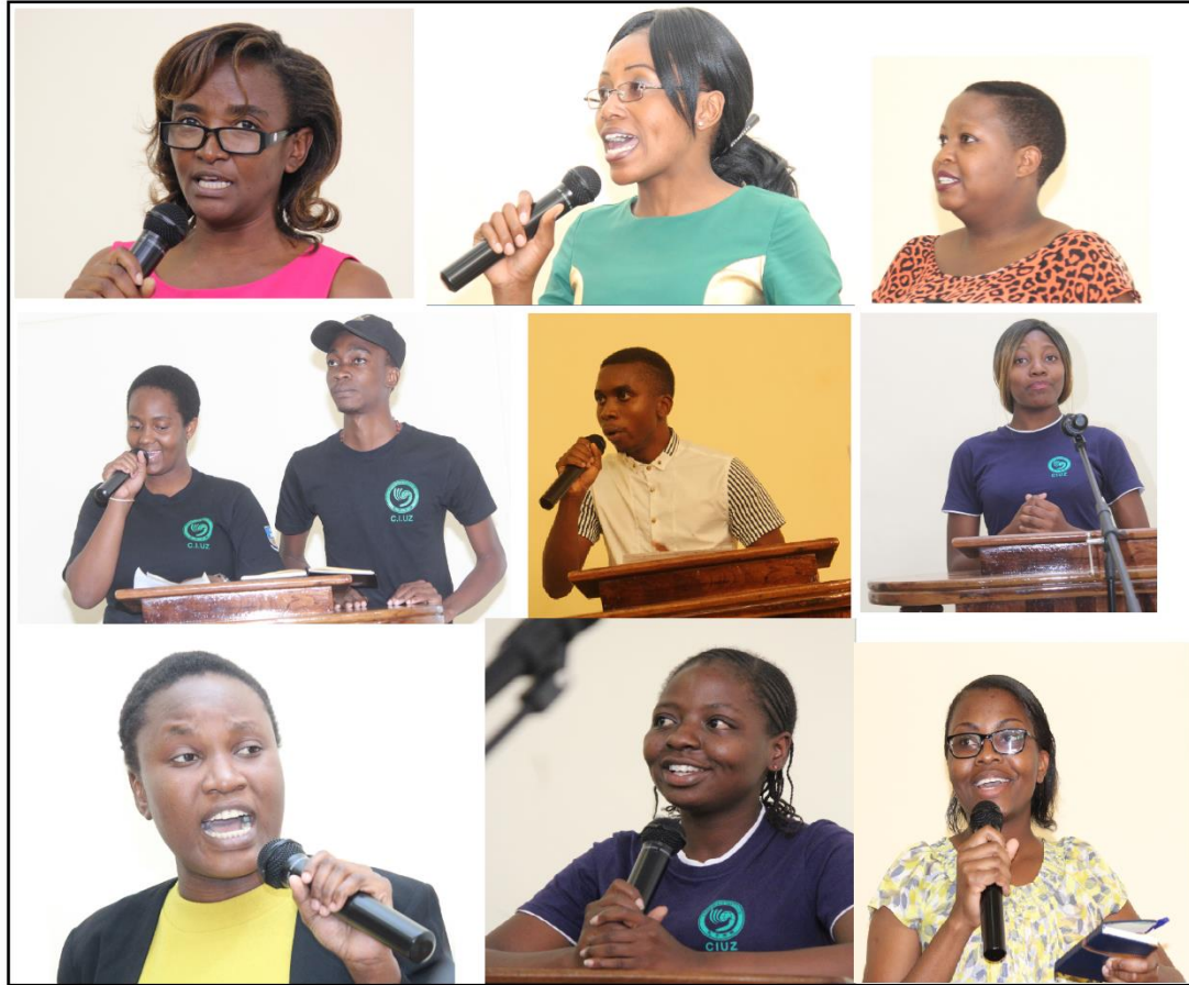
Individual Performances from Chinese and French Students