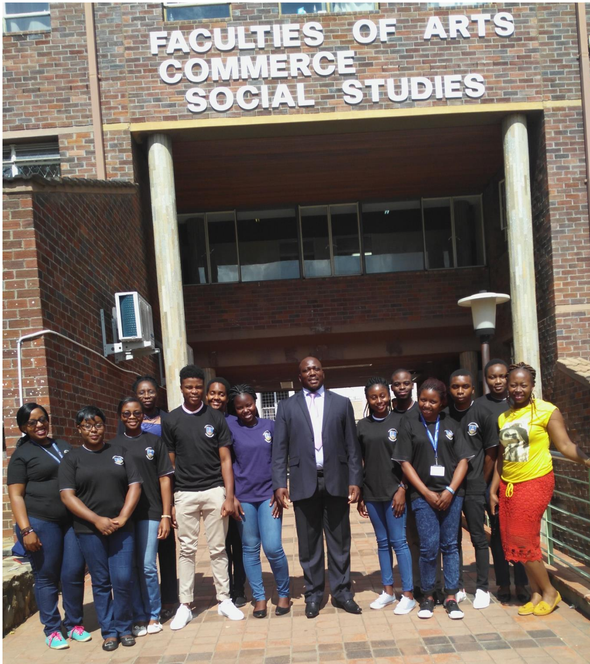
Brand Ambassadors Group Photo

Below is a collage of pictures of the event.