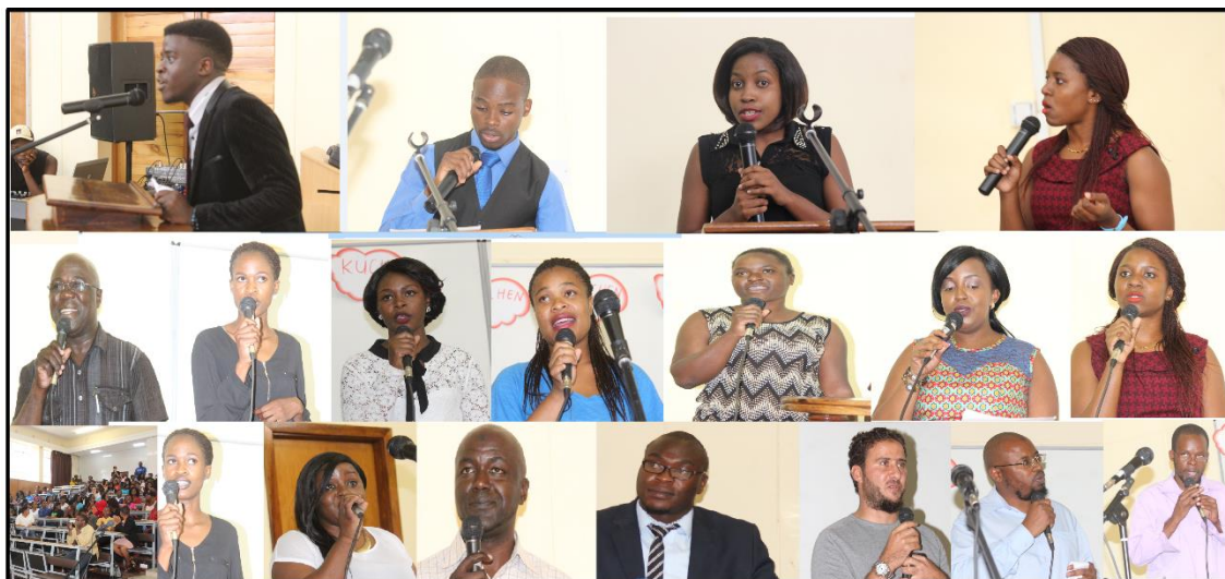
Individual Performances from German, French, Portuguese and New hope Students