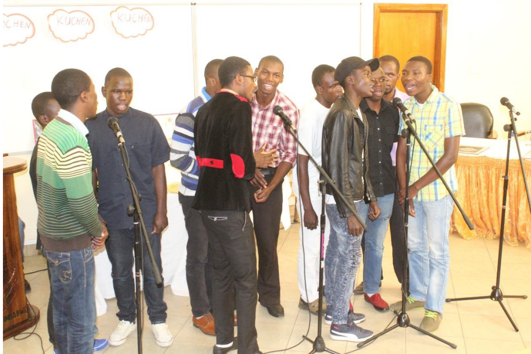
New Hope, Arabic Choir